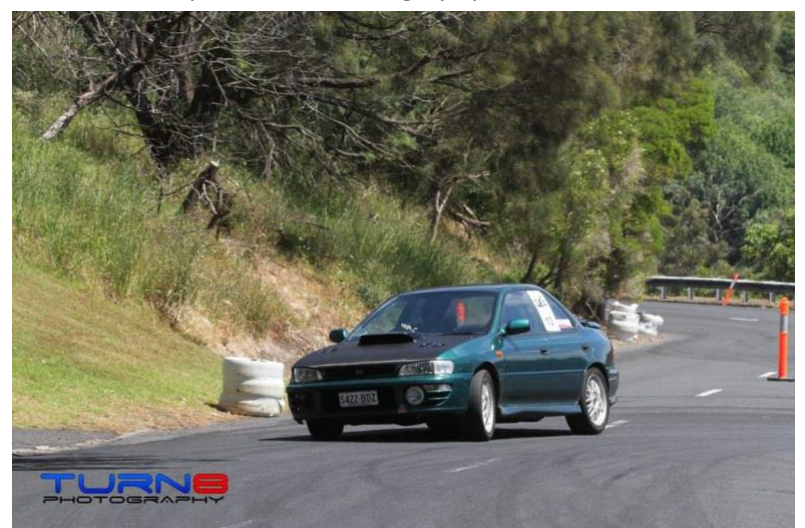
Ken Trimnell #224 and Leanne Doddridge #13 both competed in the weekend event, clocking up times of 1:00.93 and 1:07.89 respectively.