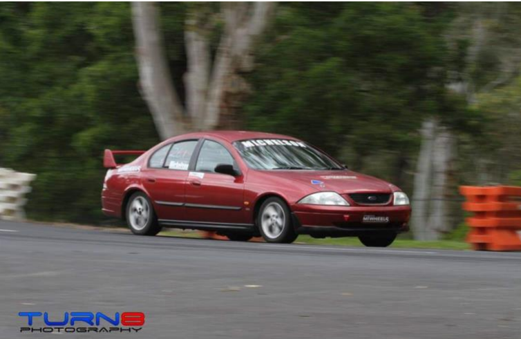
Left: #261 Jack Michelson's quickest time over the 3 day event was 1:04.30. Photo courtesy of: Turn 8 Photography

Below: Sam Becker #66 completed all 9 runs over Saturday and Sunday with his quickest time being 1:04.32. Photo courtesy of: Turn 8 Photography