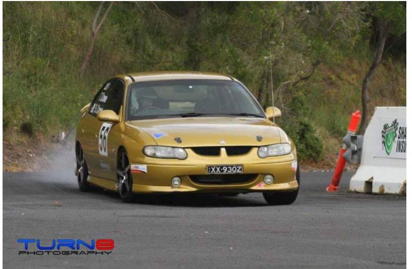
Tristan Crowe #56 ended the weekend with a time of 1:02.01. Tristan shared his VX SS with Tania Langcake #430 over the weekend.