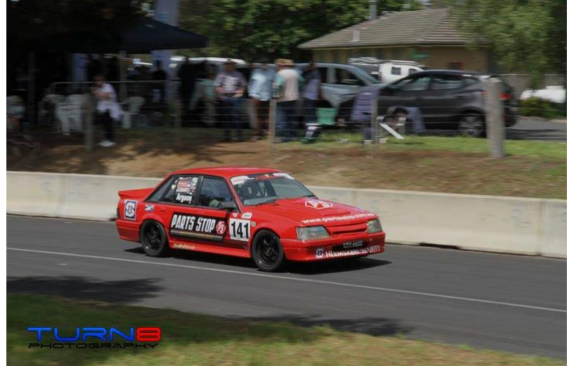
Mick Argoon #141 finished outright at 21<sup>st</sup> place, his quickest run up the hill was 56.61.