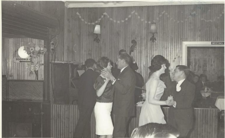
SEAC Annual Dinner and Awards Night 1965