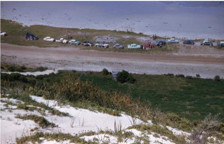
Club Picnic about 1964