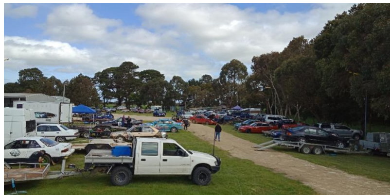
SEAC Park Pit Area