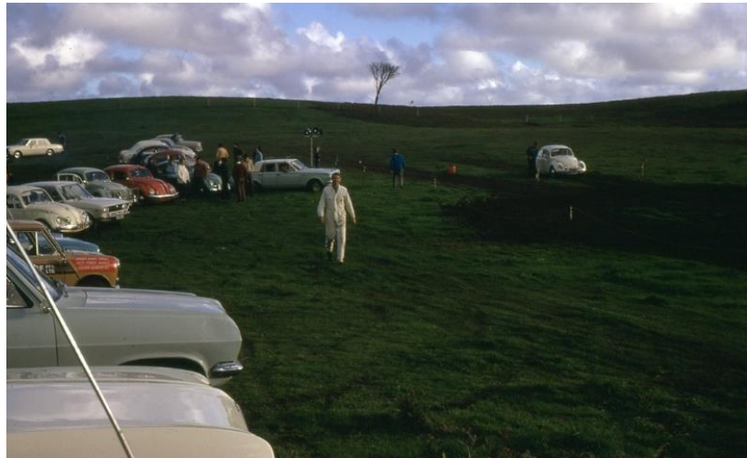
SEAC Gymkhana 1970