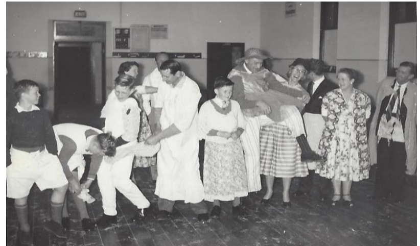
Club Games Night 1959