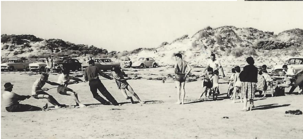
Club Picnic about 1960