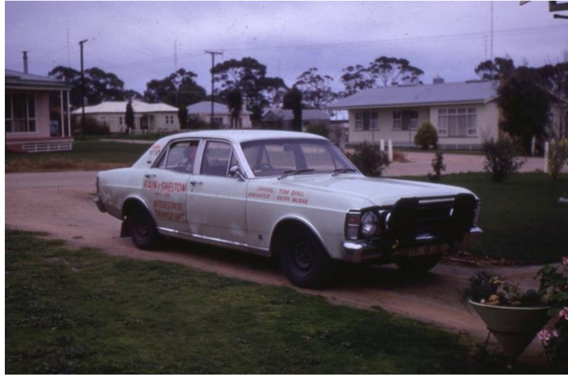
Ampol Trial 1970