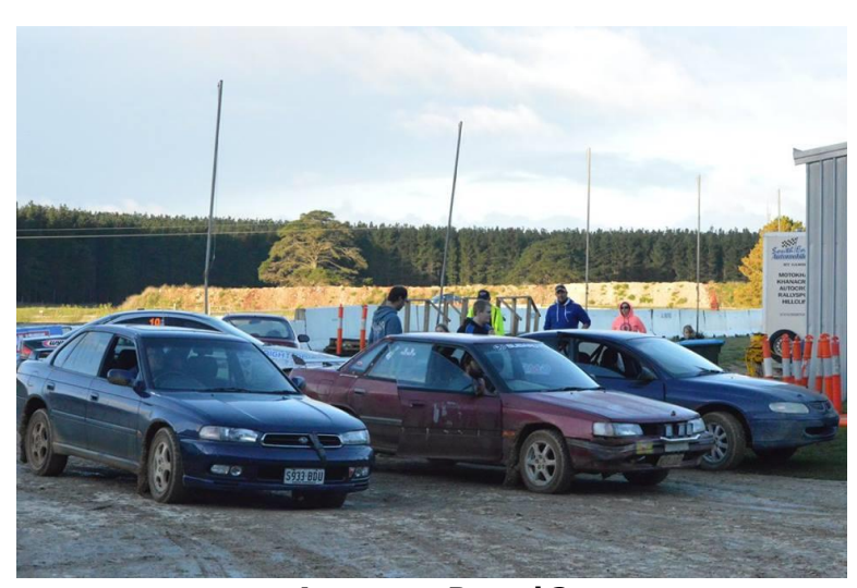
Autocross Round 3