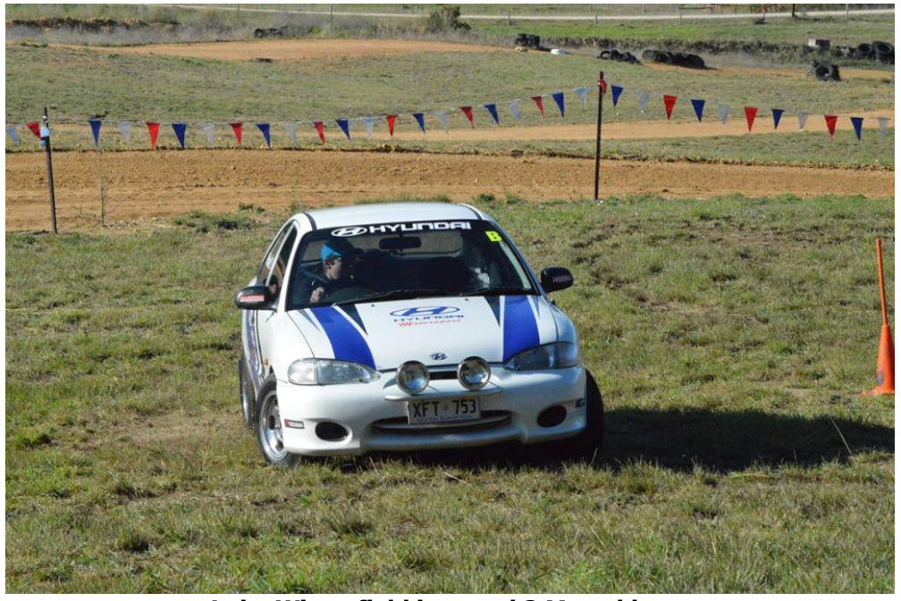
Luke Winterfield in round 3 Motorkhana