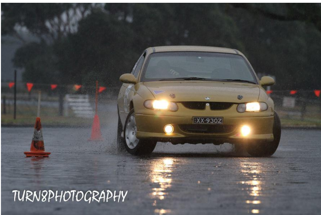
Tristan Crowe at the Round 1 Motorkhana