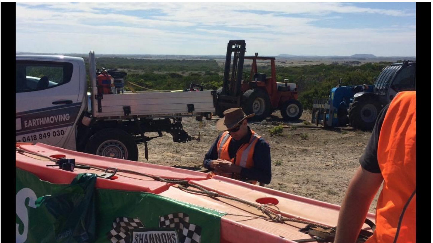
Sleeping on the job...