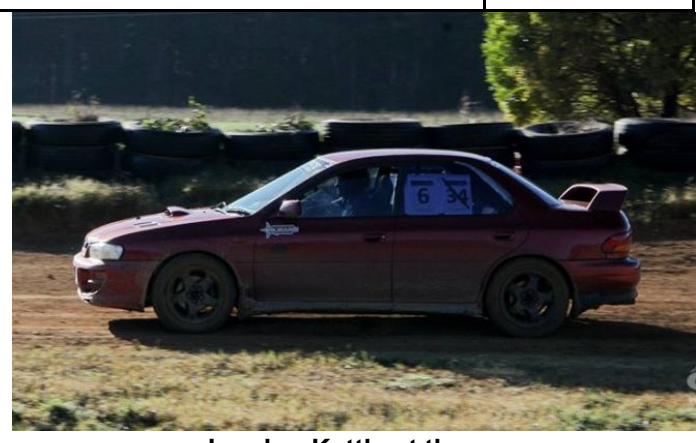
Lyndon Kettle at the Australian Khanacross Championship