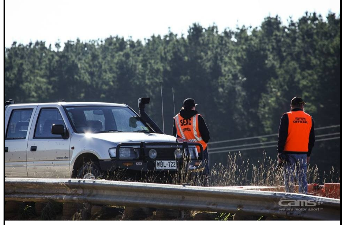
A big, big thank you to everybody that gave their time and helped out over the weekend!!