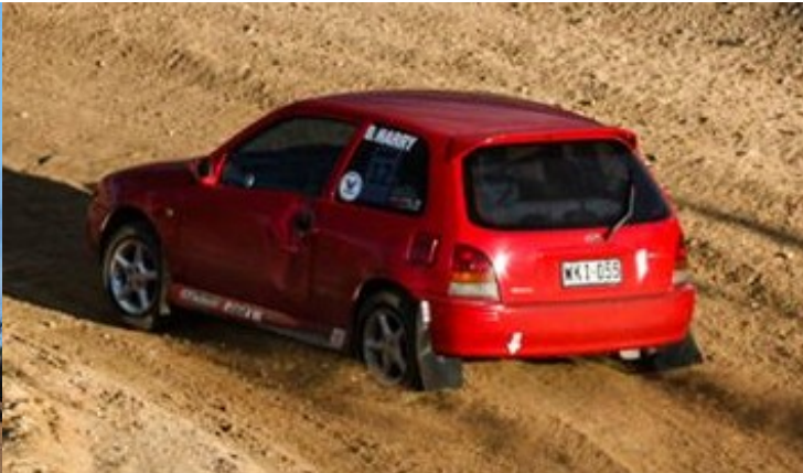
Bradley Harry: 2nd in Junior Standard.