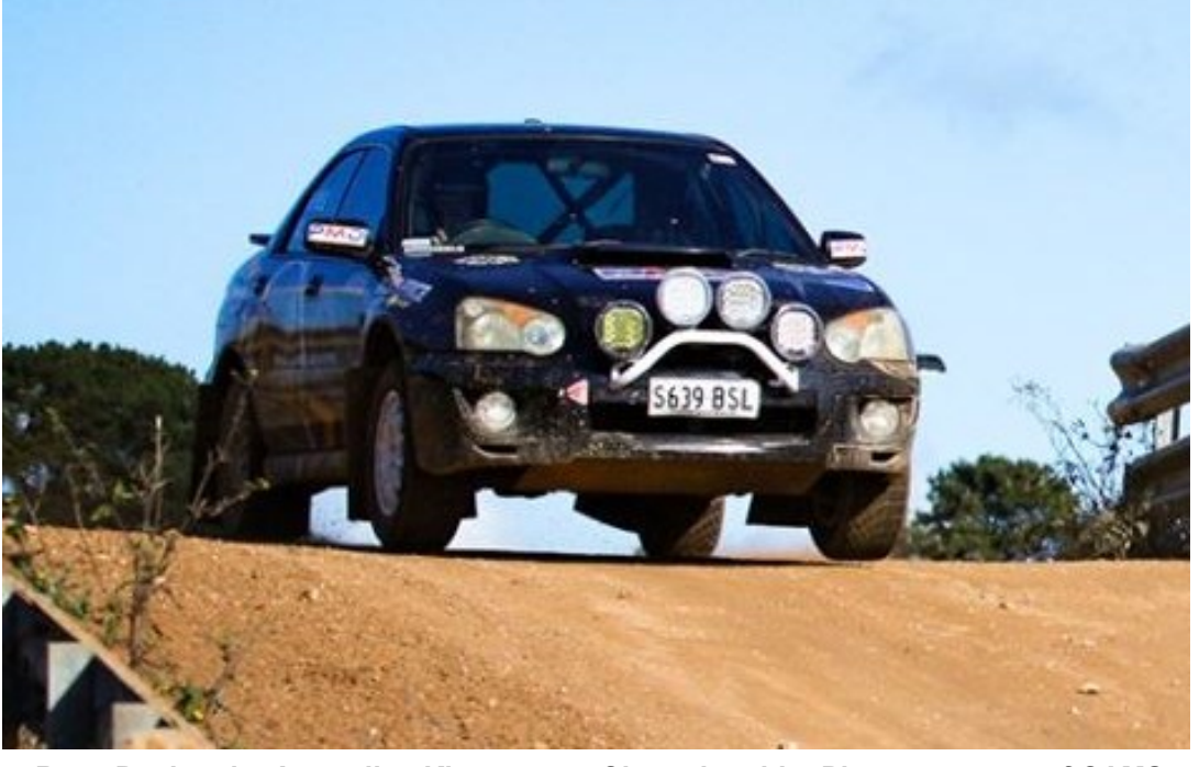
Ryan Poel at the Australian Khanacross Championship.