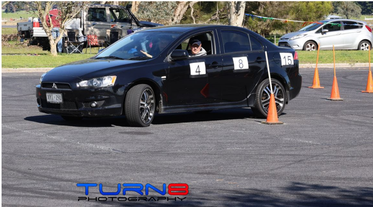
JANEWAY FAMILY - MOTORKHANA