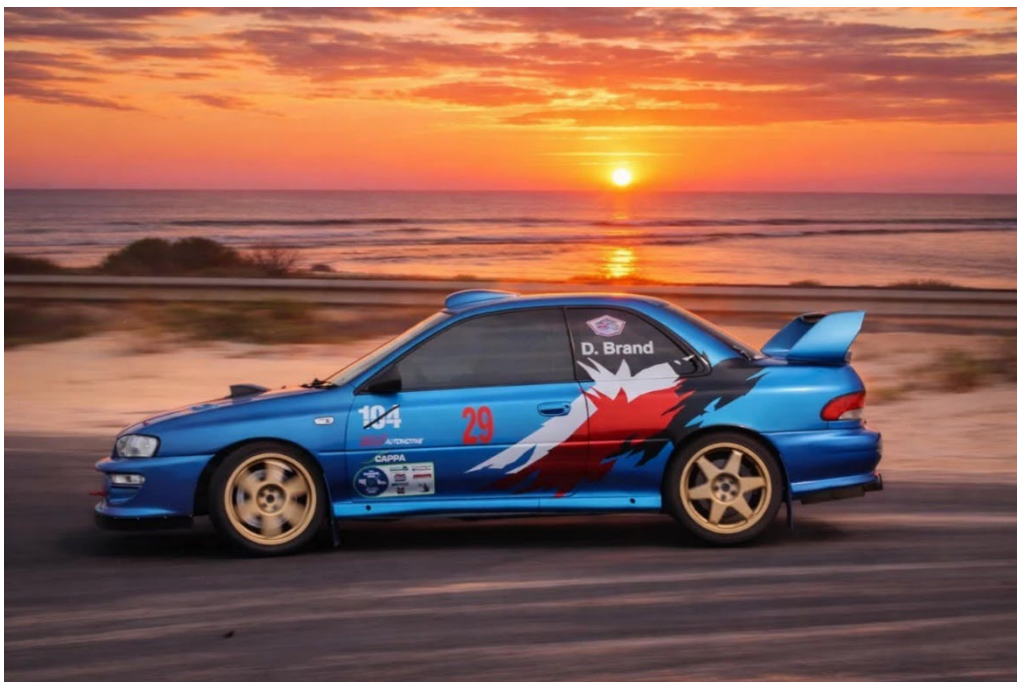
Twin Peaks Hillclimb 2026