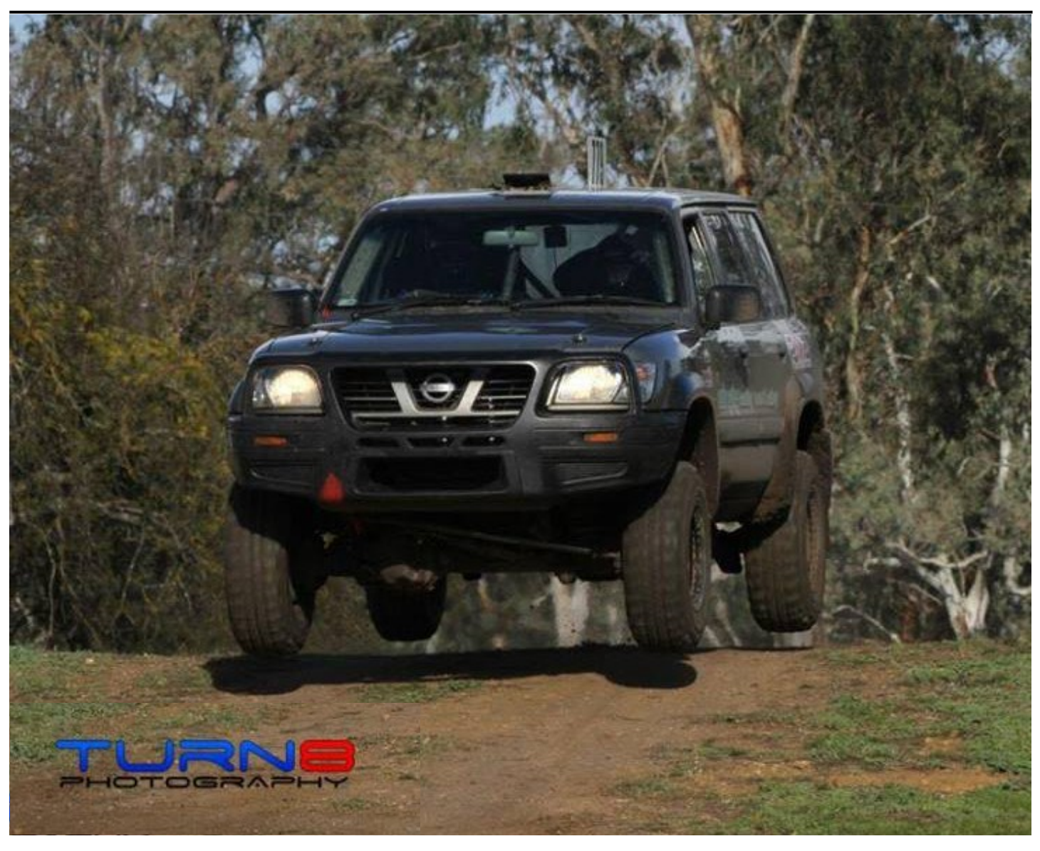
Heath & Michelle Weedon at the Limestone Coast Off Road Club's Masters at Moorex