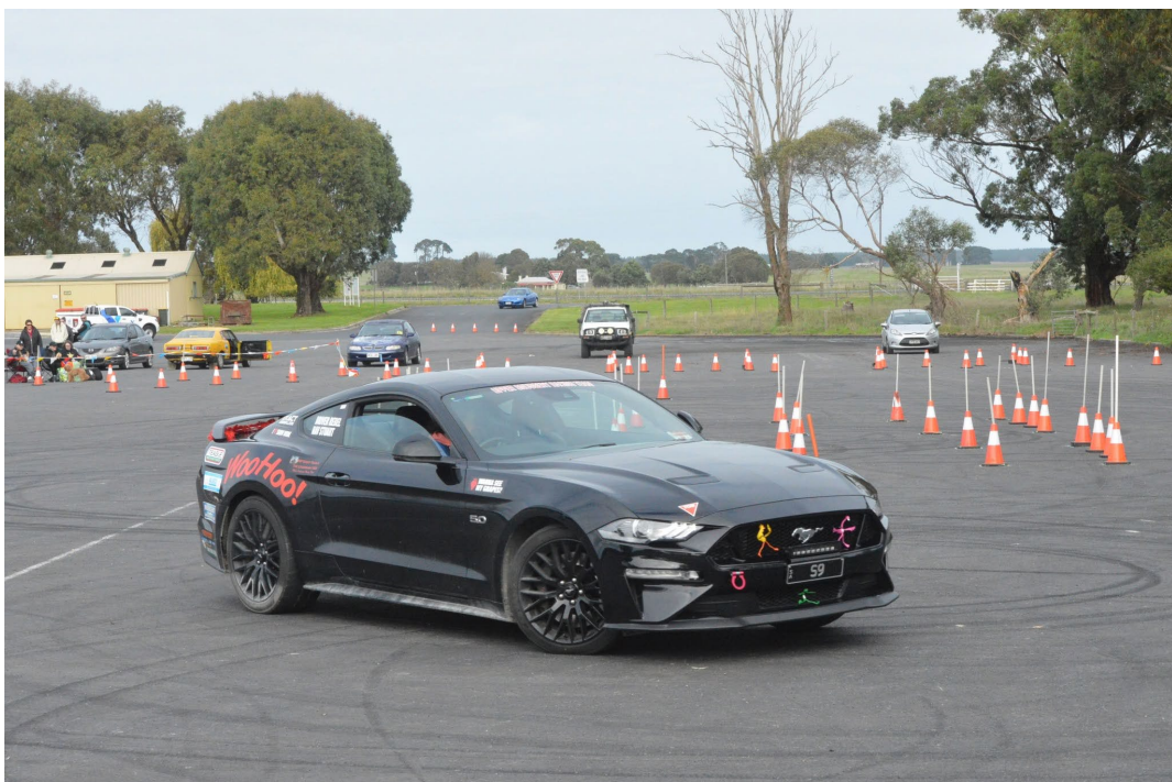
Rebel Skirving – Motorkhana 14 th June 2026