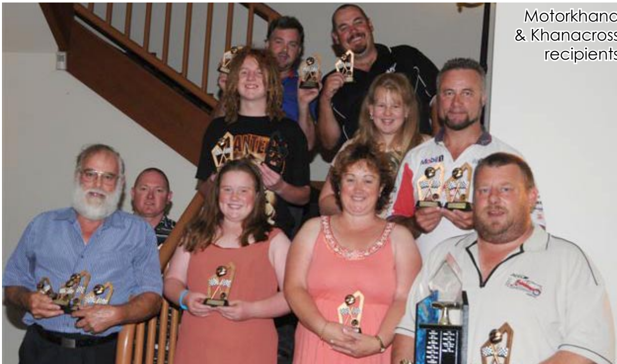
SEAC CLUB PRESENTATION DINNER