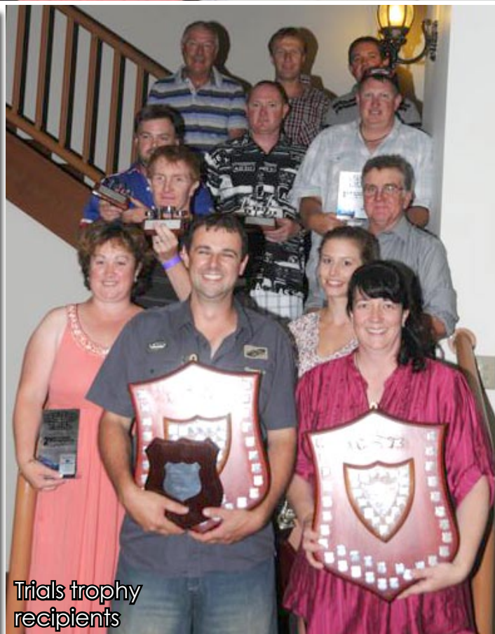
Trials trophy recipients